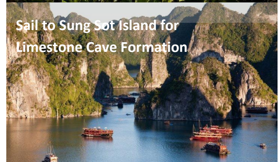
Sail to Sung Sot Island for Limestone Cave Formation