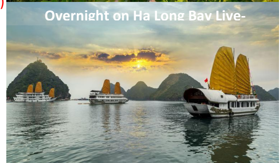
Overnight on Ha Long Bay Live-