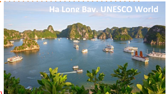
Ha Long Bay, UNESCO World