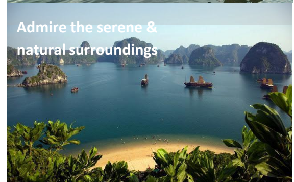
Admire the serene & natural surroundings