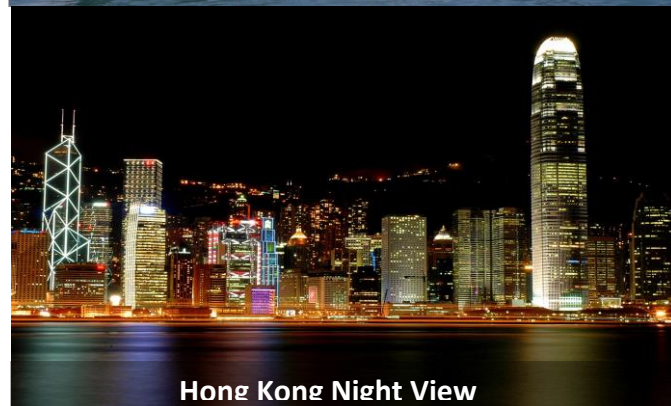
Hong Kong Night View