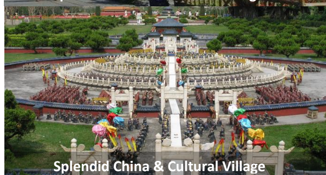
Splendid China & Cultural Village