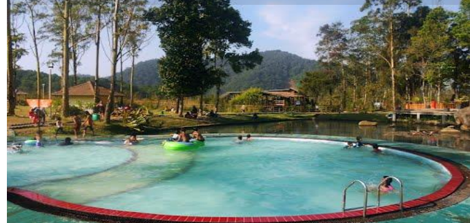
Kampung Daun Valley Restaurant