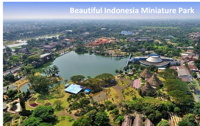
Beautiful Indonesia Miniature Park