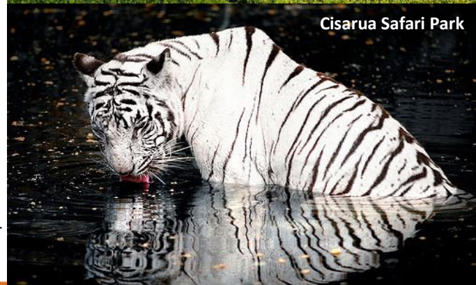
Cisarua Safari Park