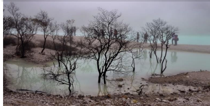
Ranca Upas Hotspring