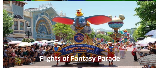
Flights of Fantasy Parade