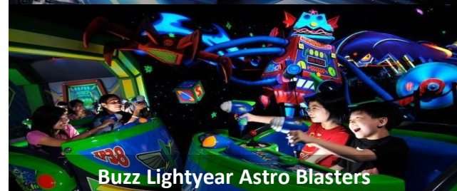
Buzz Lightyear Astro Blasters