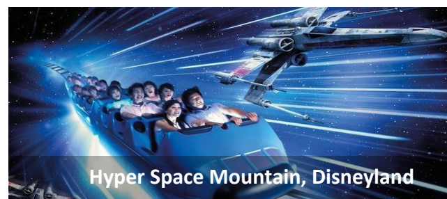
Hyper Space Mountain, Disneyland