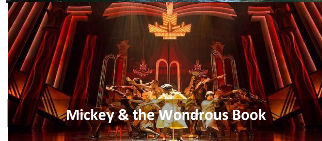
Mickey & the Wondrous Book